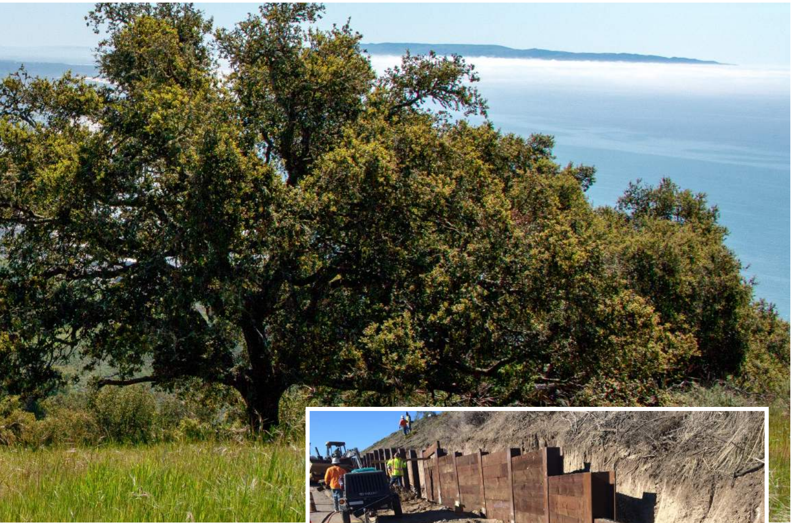
Right: A new retaining wall along Mattie Road leads to the entrance of the Pismo Preserve