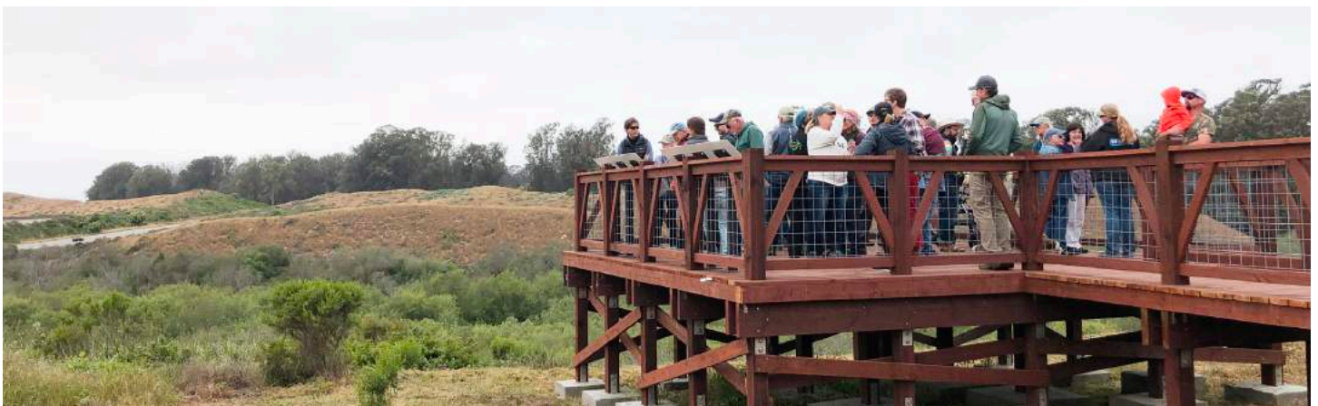
Neighbors, volunteers, and Land Conservancy staff and board enjoy the views from the newly constructed overlook and boardwalk.