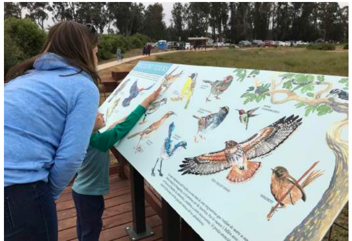
Guests enjoyed new interpretive signage which illustrates native birds, plants, and ecosystem habitats.